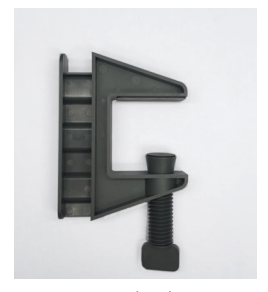
CHARCOAL (#542) DESK CLAMP