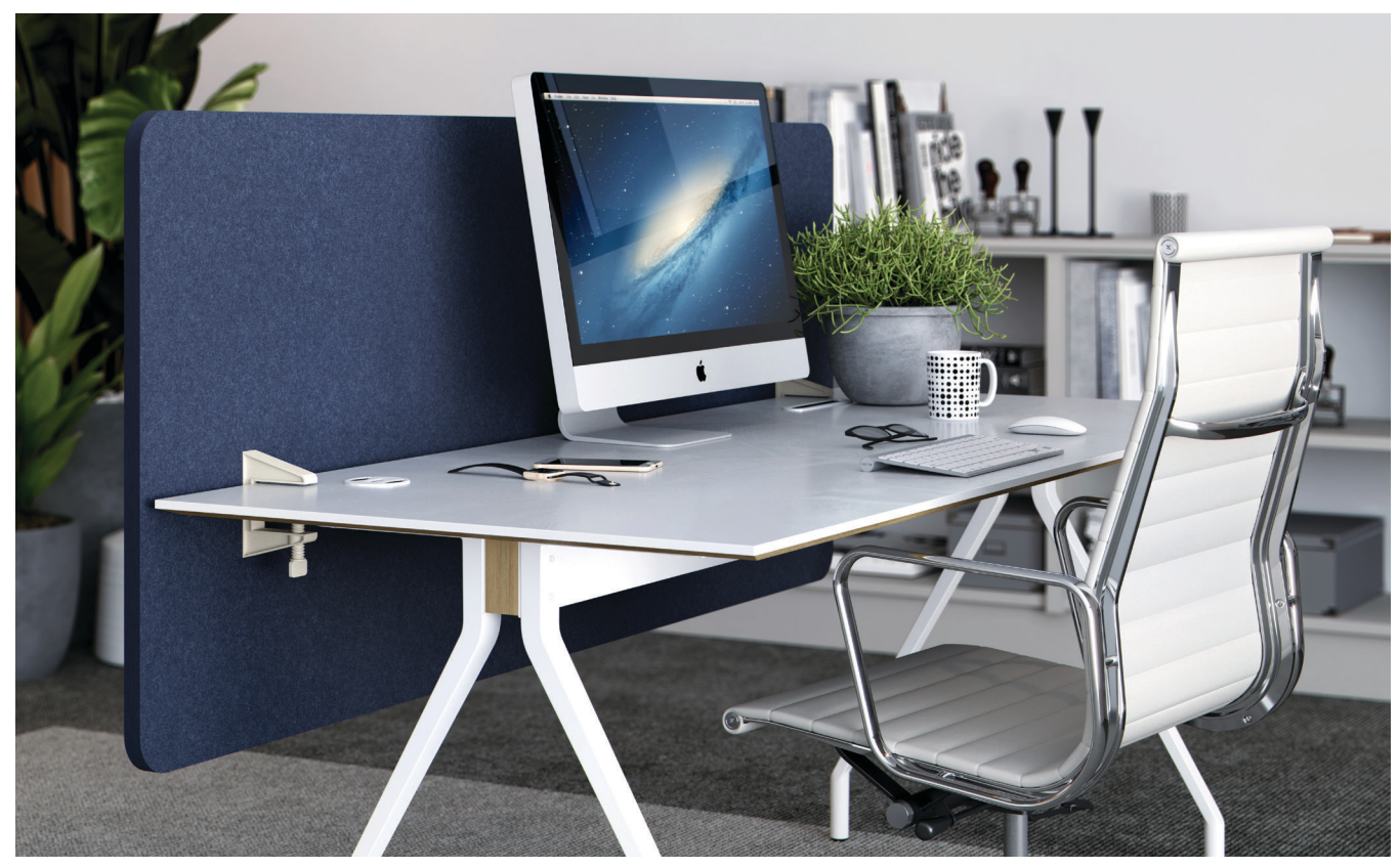
IMAGE FEATURES ADAPT CLASSIC IN COLOURWAY #365 WITH DESK CLAMPS IN #908