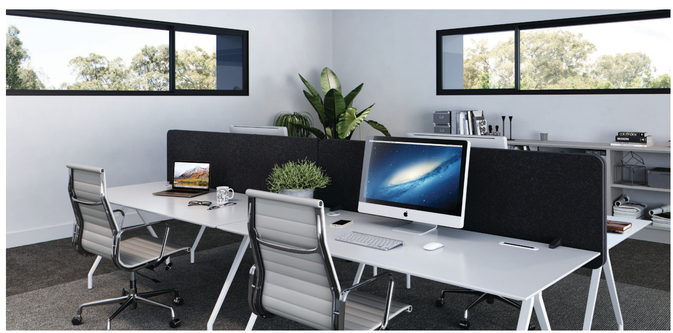
IMAGE FEATURES ADAPT SOCIAL IN COLOURWAY #542 WITH DESK CLAMPS IN #542