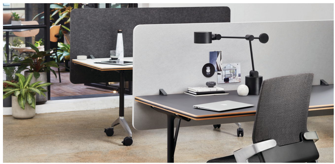
IMAGE FEATURES ADAPT CLASSIC IN COLOURWAY #542 AND #101 WITH DESK CLAMPS IN #542